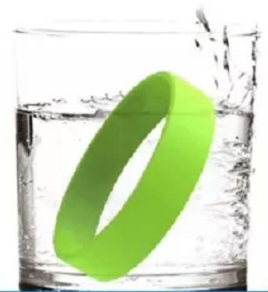
◀ Swimming pool