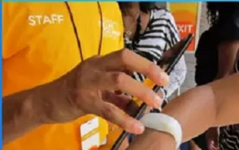
Cashless Payment ▶