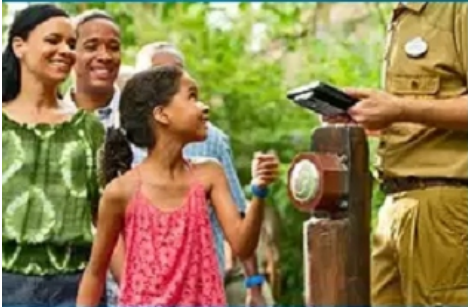
◀ Access control Management